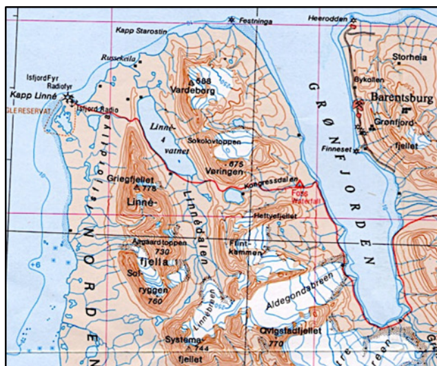
Figure 2: Kapp Linné and Linnévatnet. Isfjord Radio at Kapp Linné served as our base of operations.