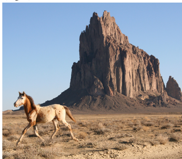
Figure 1: View of the Ship Rock diatreme from the South-East

minette plugs, it intruded the surrounding Cretaceous Mancos shale in middle Oligocene times. Differential erosion has left Ship Rock towering 550 m above the surrounding plains (Fig. 1).