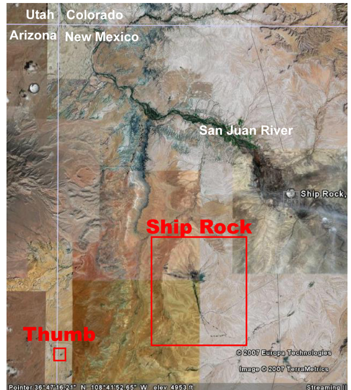
Figure 2: Satellite image (from Google Earth) of Four-Corners region with study areas around Ship Rock and Thumb igneous centers highlighted as red boxes. Length of South dike visible in satellite image is 9km.

and female-like forces re-establish balance. In such a bilateral Earth systems model gravity occupies an interesting aspect in that it acts both as a changing and balancing force. Gravity as a tool for subsurface imaging is therefore a link to Navajo understanding of Nature.