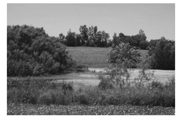
Figure 2: A photograph of Hunt's Bog. The cores were taken in the alder grove along side the pond.

1-meter segments after auguring to an initial depth of 1.5 meters. Due to sediment loss on each thrust, two offset cores were extracted to