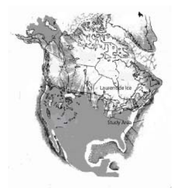
Figure 1: The Erie Lobe of the Laurentide Ice Sheet in Ohio (modified from Chernicoff and Venkatakrishnan).

Hunt's Bog is located in southwestern Ohio just west of the Indiana-Ohio state border and Union City. It sits on the northern side of the Union City Moraine, proximal to the retreat of the Miami sublobe of the Laurentide Ice