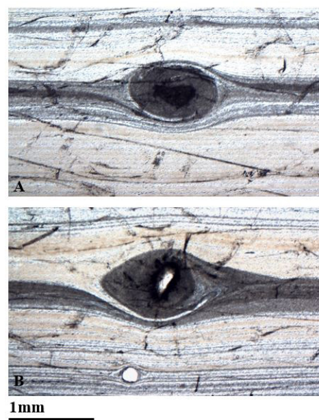
Figure 4. Photomicrographs showing deformation of flow bands around micro-phenocrysts, consistent with simple shear (from sample MR11.9).

Preliminary analysis reveals little to no systematic variation of microlite trend alignment with stratigraphic or lateral position within the basal shear zone of the Mynyon Falls Rhyolite. With few exceptions, microlites are well aligned within the intact flow-banded obsidian and the underlying basal breccia. The degree of alignment is noticeably high compared to microlite orientation distributions measured for samples representative of the upper surfaces of rhyolite lava flows and domes (Befus et al., 2014; 2015). The high degree of microlite alignment at the base of the flow is consistent with numerical results indicating that most of the strain associated with emplacement of viscous rhyolite lava is accommodated within a basal zone of shear, while the