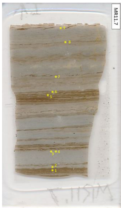
Figure 2. Scan of thin-section MR11.7, showing microlite measurement sites (asterisks) for colorless and brown-colored flow bands along a vertical transect parallel to the stratigraphic “up” position of the oriented rock sample.

orientations is depicted in Figure 1 and described in Seitzinger (this volume). The method is similar to the simplified approach of Befus et al. (2014), which was adapted from the digital reconstruction method of Manga (1998). Because of space limitations, the details of the method are not repeated here.