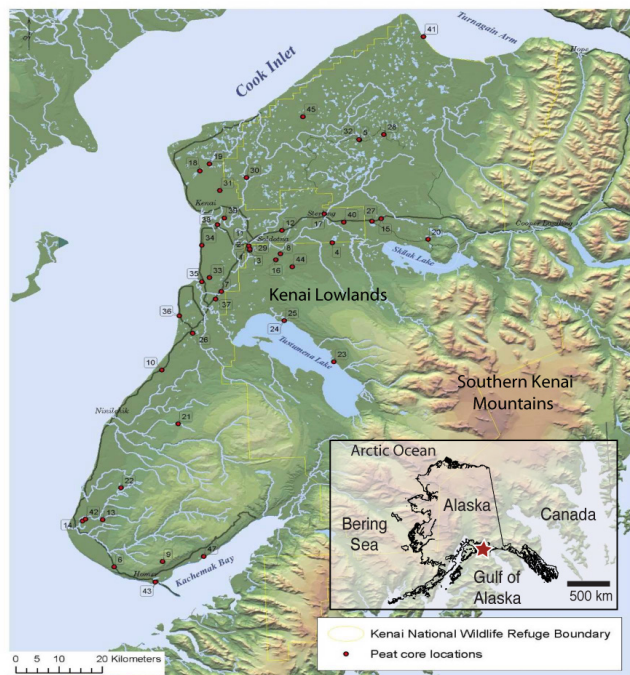
Figure 1. The Kenai Peninsula of southcentral Alaska. The numbered sites are those that are relevant to the present study at Jigsaw Lake (28) and discussed in the text and subsequent contributions (Reger et al., 2007): (1-3) Headquarters Lk, (4) Brown's Lk, (5) Swan Lake Rd, (6) Diamond Cr, (7) Coal Cr, (8) Funny River Rd, (9) Wynn Nature Center, (10) Que'ana Bar, (11) Ski Hill Rd, (12) Big John's, (13) Anchor Pt Tr, (14) Anchor Pt, (15) Watson Lake, (16) Woodcutting Rd, (17) Moose River Rd, (18) Nikiski South, (19) Nikiski North, (20) Engineer Lk, (21) Oilwell Rd, (22) Tall Tree Rd, (23) Point Lk, (24) Fox Lk 1, (25) Fox Lk 2, (26) Coho Lp, (27) Bottenintnin Lk, (28) Jigsaw Lk, (29) Headquarters Lk, (30) No Name Cr, (31) Marathon Rd, (32) Merganser Cr, (33) K-Beach Gasfield, (34) K-Beach bluff, (35) Kasilof River, (36) Coho Lp bluff, (37) Coal Cr South, (38) Warren Ames Bridge, (39) Kenai River terrace, (40) Sterling Moosehorn moraine, (41) Chickaloon bluff, (42) Anchor Pt North Fork Rd, (43) Homer Beach Munson Pt, (44) Funny River Horse Trail, (45) Swan-son River Fen, (46) Discovery Pond, (47) Stones Steps bluff (from Reger et al., 2007).

area (Figure 1). The Jigsaw Lake basin study site originated as an ice-filled kettle about 13-15,000 years ago with the melting of Wisconsin-age glaciers that covered most of the Kenai Peninsula (Reger et al., 2007). Kaufmann (unpublished data) recovered a sediment core from the Northeast basin at Jigsaw Lake that contained a thin terrestrial peat 12 m below the present lake level suggesting a lower water stand at 9.5 ka and presumably drier conditions during this time of the Holocene thermal Maximum (Kaufmann et al., 2004). Based on macrofossil work at nearby Portage and Arrow Lakes within the lowland complex, studies by Anderson et al, (2006) inferred rising lake levels after 8.0 to 8.1 ka. An additional core from Jigsaw Lake (Mitchell and Kishaba, unpublished data) had a basal age of 9.6 ka supporting the 9.5 ka age obtained by Kaufmann. Testate amoebae work from the same core indicates a general rise in water levels since 9.5 ka with yet-